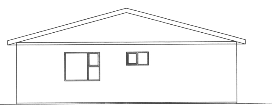
útlit vestur mkv 1:100