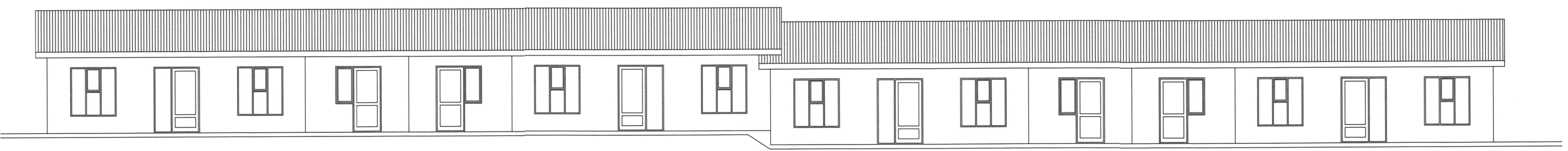
útlit norður mkv 1:100