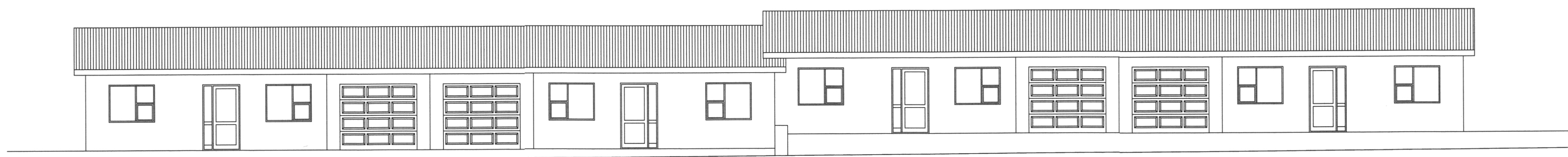
útlit suður mkv 1:100

Samþykkt á fundi byggingar- nefndar Vestmannaeyja 16. MAÍ 2019 Byggingarfulltrúinn í Vestmannaeyjum